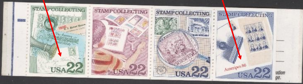
Unexploded Booklet (opened) Missing black on both panes

1986, Scott 2198-2201, missing black errors.